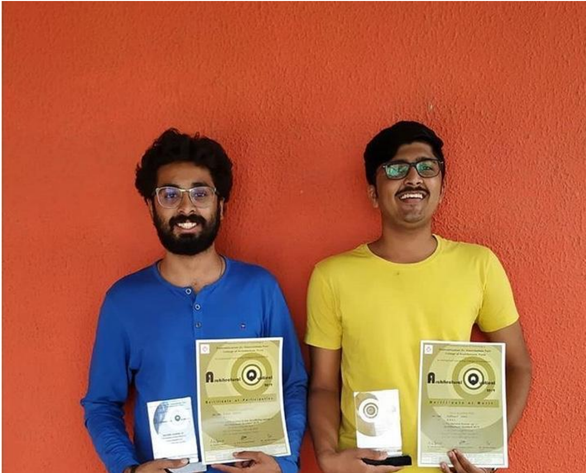
Picture of the participants at the Event