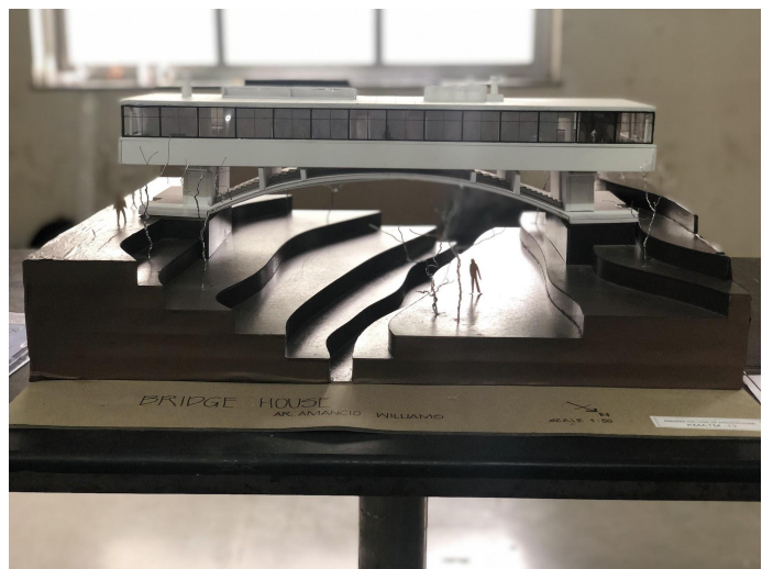
Photograph of the Model