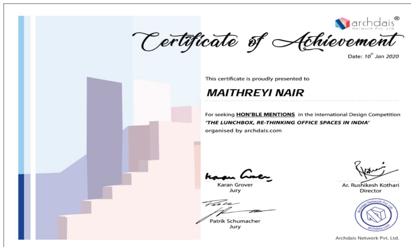
Photograph of the certificate

The challenge was to design an office spaces in India, where the design was mostly judged on the strength of the concept, thought process and design development based on the nature of the concept.