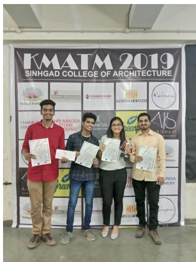
Photograph of the participants at the event